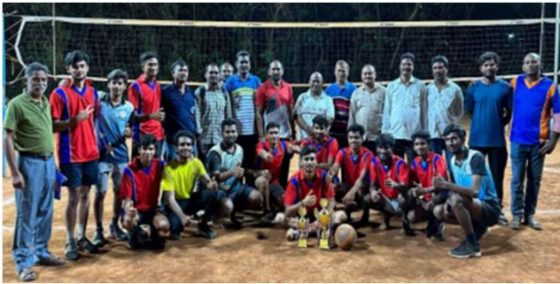
G&S members Runners-up at NITW, Tournament

Games and Sports Club (G&S): Involves students in sports and competitions, aiming to win medals in inter-collegiate and inter-university tournaments.