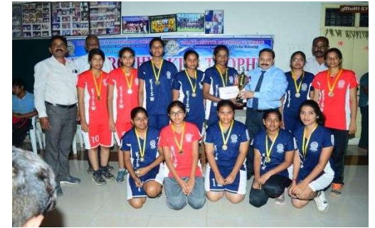
Basket Ball (W) Winners