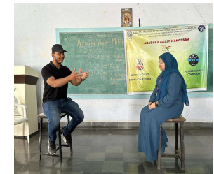
AZADI KA AMRIT MAHOTSAV

LIT Organizes Azadi Ka Amrit Mahotsav. LIT takes pride in hosting Azadi Ka Amrit Mahotsav, commemorating the spirit of India's independence struggle and celebrating the nation's journey towards freedom and progress