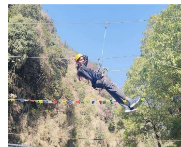
NSS Adventure Camp

One of our NSS Volunteer Shrestha has been selected for RD camp and has undergone the training successfully from 01-01-2024 to 31-01-2024.