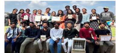
MDF USK Event

The MDF Club proudly presented the "Sankriti Cultural Fest," a grand showcase of vibrant traditions, captivating performances, and delectable cuisines. This event provided a platform for celebrating the rich tapestry of cultural diversity, fostering unity, and promoting cross-cultural understanding among participants and attendees