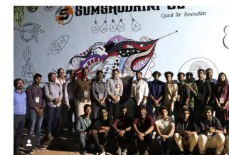
Wall Art for SUMSHODHINI'22