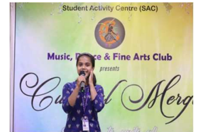
Cultural Merge 2021– 22