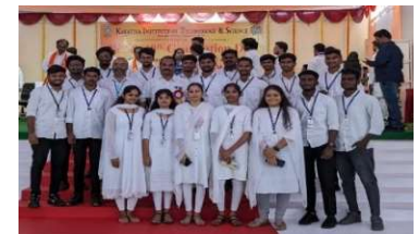
DC on Graduation Day

Ensuring safety involves preventing ragging, fostering camaraderie through brotherhood, and cultivating harmony through discipline. Strict policies and mutual respect are vital for achieving a safe, inclusive, and harmonious campus environment.