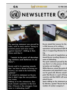
A news letter was published by PMC