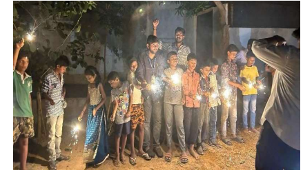
Diwali Celebrations at orphanage by HC

Feeding animals is noble. Prioritize safety for both animals and volunteers. Plan which animals to feed and organize logistics carefully. Ensure proper food and handling procedures. Consider any permits needed. Plan a safe and efficient feeding schedule.