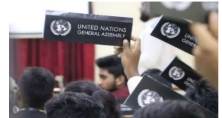
KITSMUN by LIT Club

Literary and Extramural Club (LIT): Aims to develop soft skills, interpersonal skills, and communication skills through literary and extramural activities, preparing students for personal and professional success.