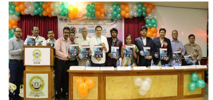
SUMSHODHINI organized by TC

Technical Club (TC): Provides a platform for interdisciplinary technical activities to strengthen students' skills in engineering and technology, preparing them for a competitive environment. Technical club Conducts national level technical symposium SUMSHODHINI.