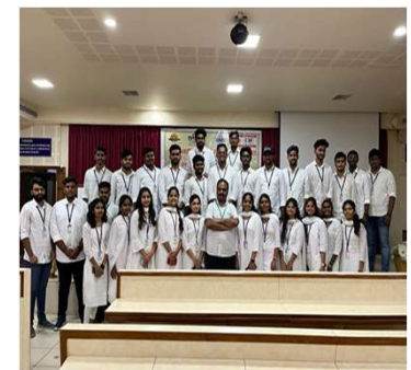
Sumshodini program (2022-23)