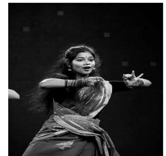
Classic Dance Performance at Sanskriti'22