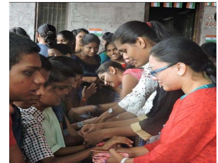
Celebration of Raksha Bandhan Orphanage